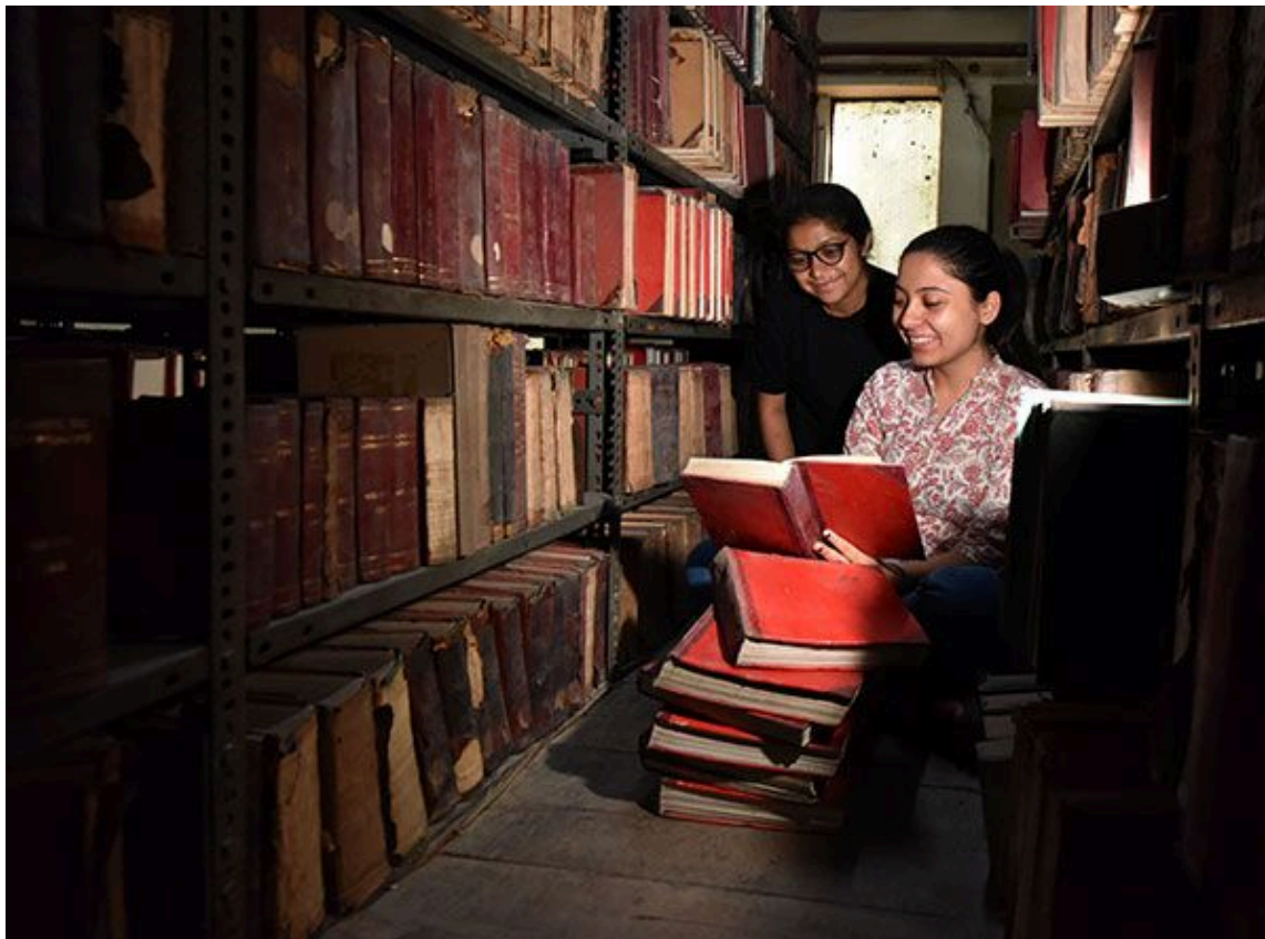
Joy of learning: Students in the nine-storey JNU library.

This is not going to be a university like so many other universities that exist today, said Union external affairs minister M.C. Chagla as he tabled the The Jawaharlal Nehru University Bill in the Lok Sabha on November